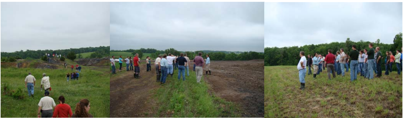
Top left – Group tours a mine site before the reclamation process. Top right – Group tours a mine site during the reclamation process. Bottom left – Group tours a mine site where the reclamation process is complete.

The Southeast Area hosted the Iowa Soil and Water Conservation Society Summer Meeting, June 10, 2011, in Oskaloosa. About 40 people met at the Lake Keomah Lodge where we learned from the Advocacy Committee about their work on a position paper for the new Farm Bill. Todd Coffelt, Mines and Mineral Bureau Chief with IDALS, gave a great presentation on the history of mining in Iowa. After lunch, the bus was loaded for the afternoon tour. Todd took us to three different mine sites in the area. We were able to see mining sites before, during and after the reclamation process. After the mud was cleaned off our boots we headed back to the lodge to enjoy dinner and social time with our fellow conservationists.