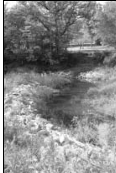
Camp Creek Stream habitat was a tour feature at the Thomas Mitchell Park.

Following the business meeting, the group made tours of the wildlife refuge and the Camp Creek stream habitat work at Thomas Mitchell Park. The day concluded at the Metro RC&D house with evening refreshments & a meal catered by the Master Griller. Our annual auction raised almost $1900! Thanks to everyone who donated so generously.